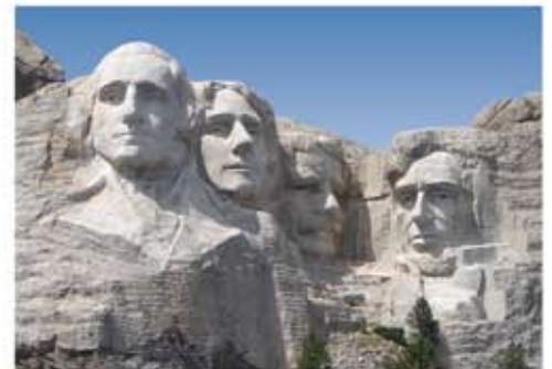
Mt. Rushmore National Memorial.

Faces and places in the Black Hills are legendary. By combining great history with overpowering natural beauty, man made wonders, a sprinkling of ethnic diversity, the pounding of buffalo hooves, and the smell of gun powder, you have the story of the Paha Sapa. Come and experience this unique learning vacation of culture and controversy with History America TOURS.