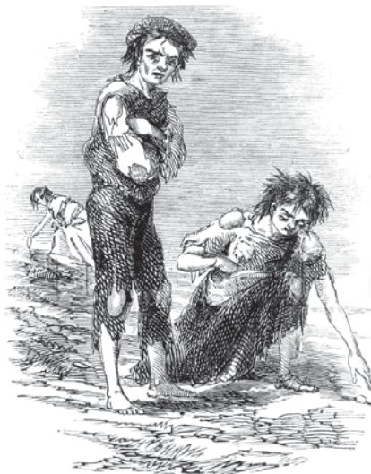
Famine children digging for potatoes (from the London Illustrated News , 1845)

so traumatic that the Irish population plummeted by death and by a desperation that sent at least half a million Irish peasants across the globe to America. The famine and the post famine depression depleted the Irish population by approximately 25%. The famine also crystallized Irish-nationalist hatred of British rule because during the famine nutritious food continued to be exported from Ireland to England. A visit to the National Famine Museum gives a clear picture of the times and the related factors that threw an entire nation into a hopeless downward spiral that lasted into the 20th century.