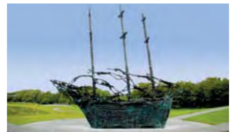
The Coffin Ship, the National Famine Memorial

Without hesitation I can tell my many dear friends who have traveled with HistoryAmerica for all these years, this is a tour you should not miss.