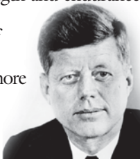
President John F. Kennedy

scenery and dramatic landscapes. This country's hills and valleys have seen Neolithic farmers clear the land and fugitives hide in its woods; its plains have witnessed great armies massing ready for combat. The best way to understand this rich cultural, political, and social history is through some of Ireland's many outstanding national museums and heritage sites. Throughout the tour you will visit places of historical significance such as Bru na Boinne, Western Europe's most prominent Neolithic site, the restored 17th century homestead of Bellghy Bawn, the Ulster American Folk Park, and Cobh—The Queenstown Story which retraces the steps of those who emigrated from Ireland.