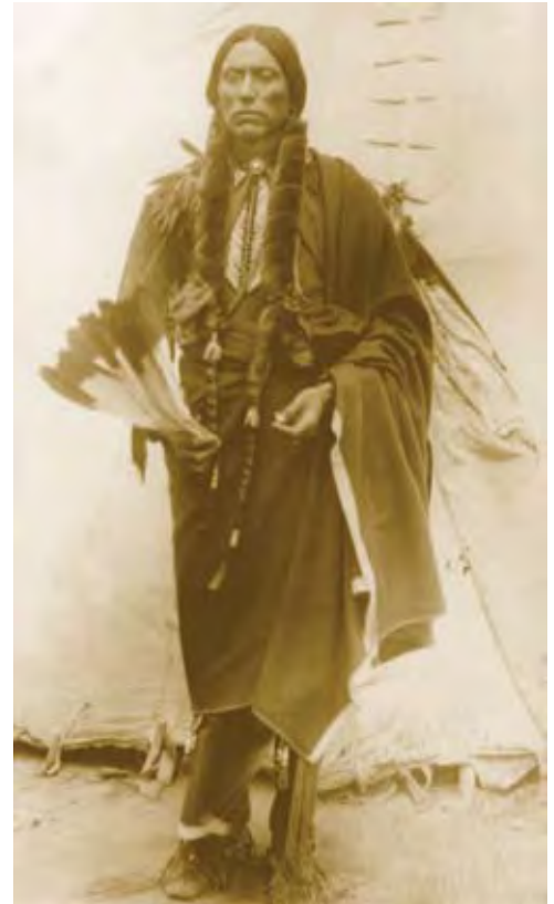
Comanche War Chief Quanah Parker

In June 1874, while in the Texas panhandle, Isatai summoned the tribes to Adobe Walls, where there were a large number of buffalo hunters who had moved into the forbidden land of the Medicine Lodge Treaty. Quanah was in charge of one group of warriors, the Quahadi. The battle was a victory but also Quanah's closest brush with death—he was shot twice. A month later Lt. Gen. Philip H. Sheridan ordered five commands to ignore the Medicine Lodge Treaty and converge on Indian hideouts. In September Mackenzie, in the most daring and decisive battle of the campaign, destroyed five Indian villages in Palo Duro Canyon. With the Indian's food source depleted and under constant pressure from the army,