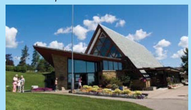
The Alexander Graham Bell Museum in Baddeck.