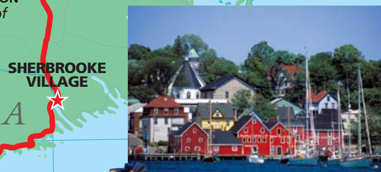
Beautiful Annapolis Royal.