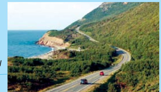
The Cobot Trail, listed as one of the world's most beautiful scenic routes, offers spectacular views.