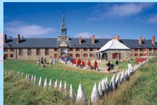
Construction of the fortified town of Louisbourg began in 1719 and took 25 years to complete. It fell into ruin and, starting in 1961, one quarter of the town was reconstructed.