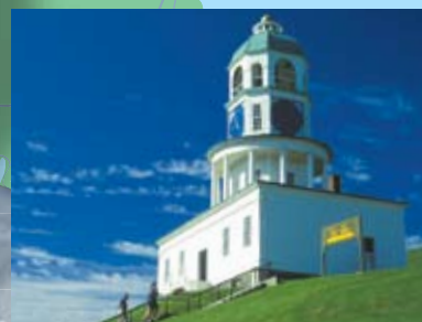
The Town Clock in Halifax.

LUNENBURG Established in 1753, Lunenburg was the first British colonial settlement in Nova Scotia outside of Halifax.