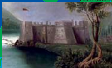
Fort Chambly on the Richelieu River. The Americans occupied the fort in 1775-76, but after losing at Quebec they retreated south, allowing the British to take the fort.

There is no more history-rich water corridor in North America than the beautiful Champlain Valley, located between the Adirondack and Green Mountains. Even if you are familiar with American battlegrounds, chances are that Lake Champlain will not leap to mind. From 1609 through 1814, however, Lake Champlain and Lake George, together with the great rivers they flow into, were the scene of contests and conflicts the likes of which had seldom been seen in civilized lands. A fledgling American republic was forged and defended here during the French and Indian War. It was used by the rebellious colonies against an absentee British government in the American Revolution. The last time the Champlain Valley was a major wartime theater was in the War of 1812. Without question, this area has a storied past of wartime service and all it entailed; it is a story of tall ships and small boats and brave men who challenged the mightiest empires in the world. Come join us on this unique tour and revisit the valley's rich past.