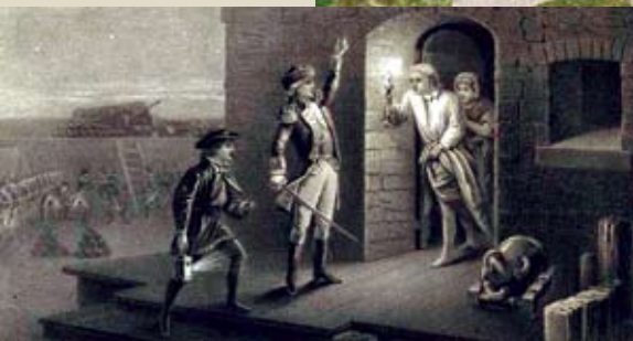
Ethan Allen and Benedict Arnold surprise the British at Fort Ticonderoga.

During the French and Indian War in 1758 the British lost a pivotal battle here to the French. Abercrombie, confident of a quick victory, ignored several viable military options and decided in favor of an unsuccessful frontal assault. Although the French won the battle they had little time to celebrate, for only a few months later British General Abercrombie led an army of 16,000 British troops north towards Carillon. After seeing the invading British, the French army of 3,500 blew up the magazine and fled the Fort. General Abercrombie then rebuilt the magazine and renamed it Fort Ticonderoga, meaning land between two waters.