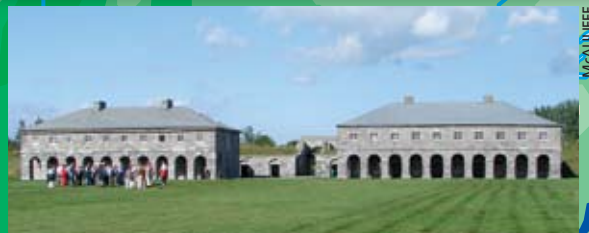
Fort Lennox on Isle aux Noix was controlled by French, British and Americans at different times.